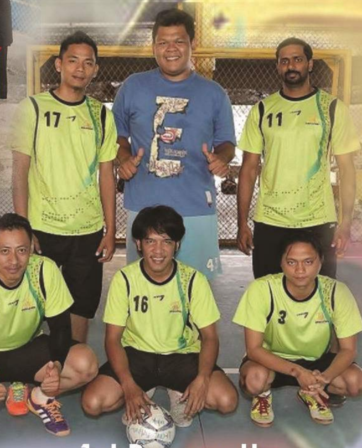
1st Runner Up Megasteel (B)