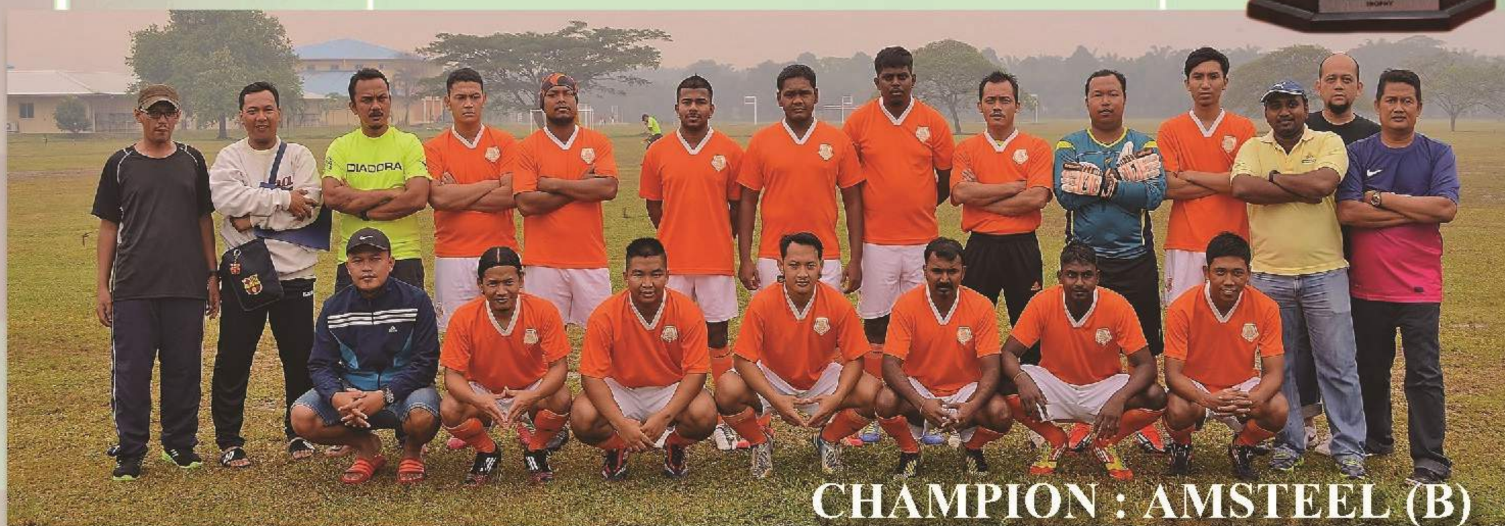
CHAMPION : AMSTEEL (B)