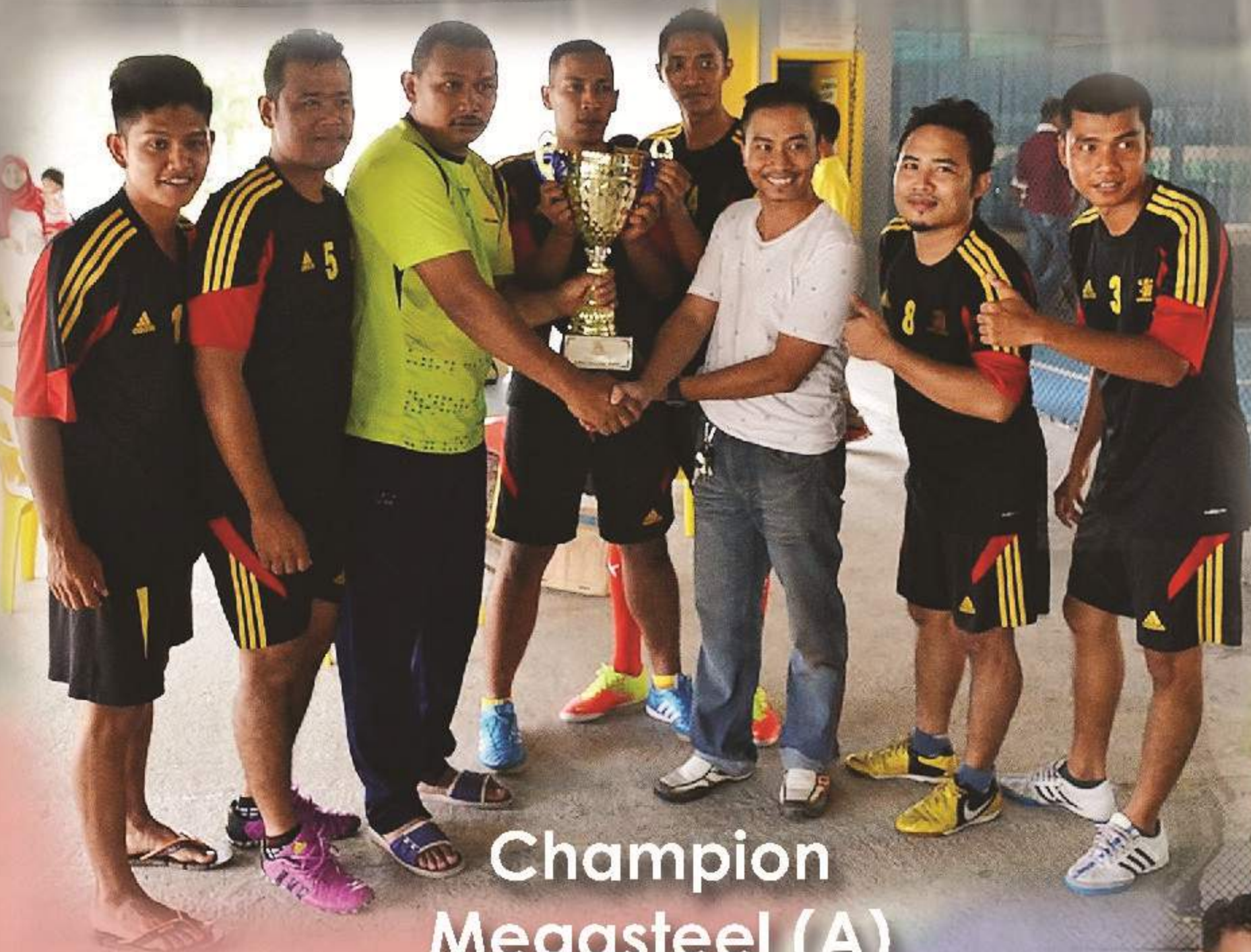
Champion Megasteel (A)