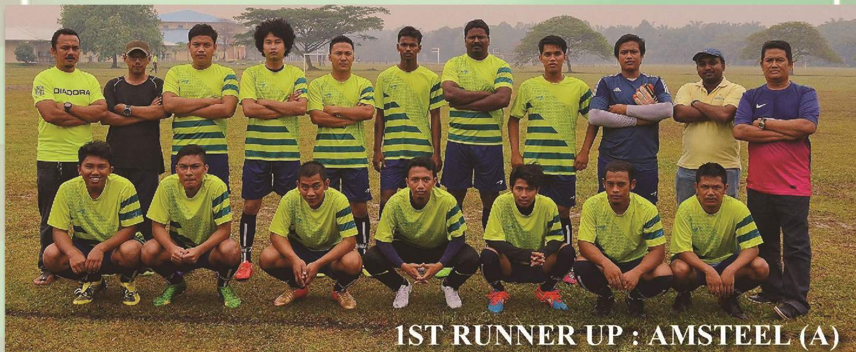
1ST RUNNER UP : AMSTEEL (A)