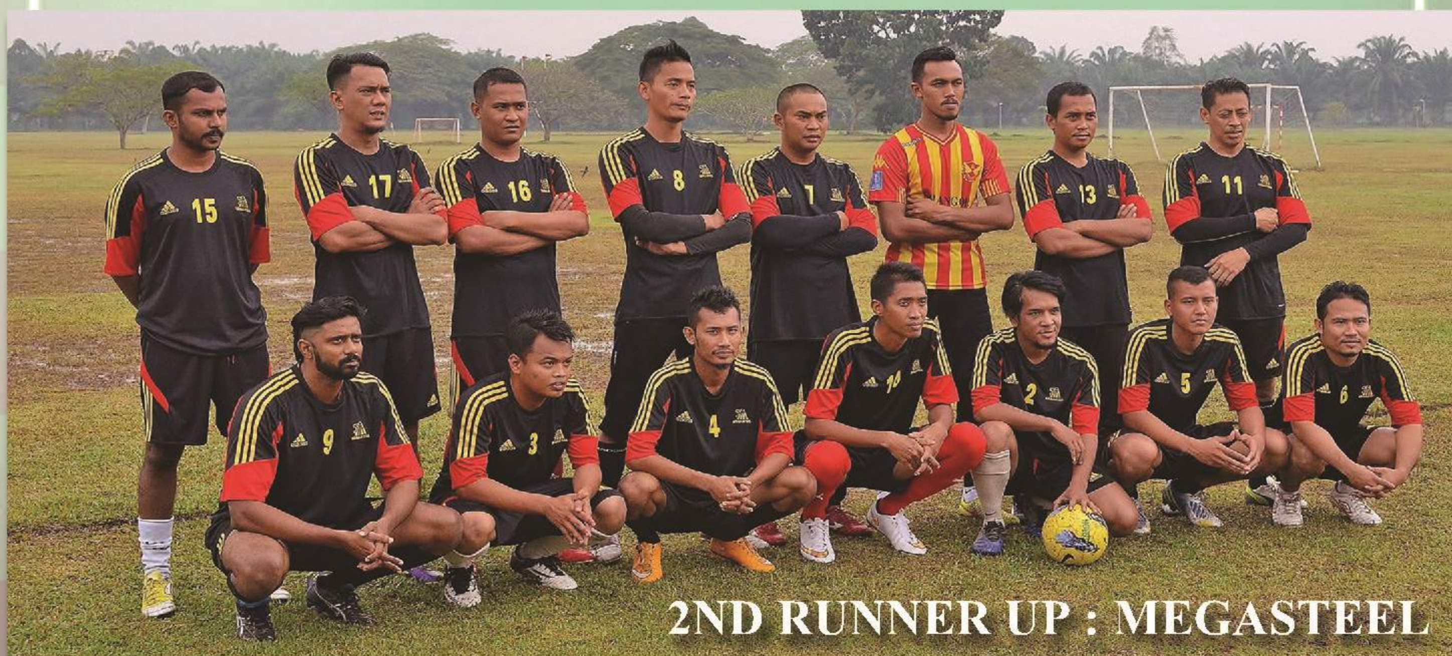
2ND RUNNER UP : MEGASTEEL