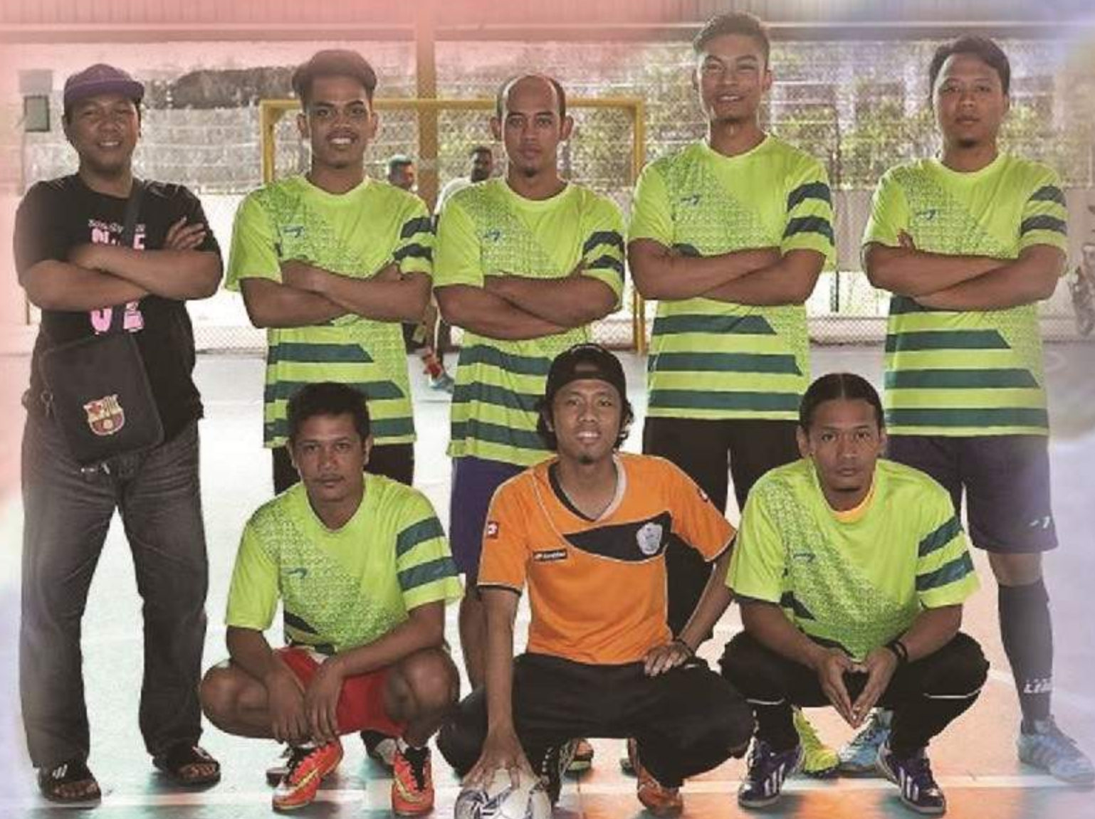
2nd Runner Up Amsteel Mills (A)